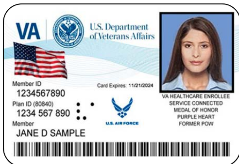
(VHIC - Earliest Expiration Date: 2023)

There are currently two versions: the Veteran Health ID Card (VHIC) and the older Veteran ID Card (VIC).