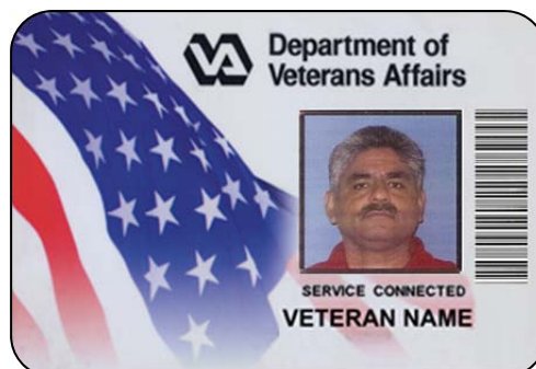
(VIC - No Expiration Date)