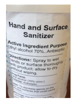
Label on Spray Bottle