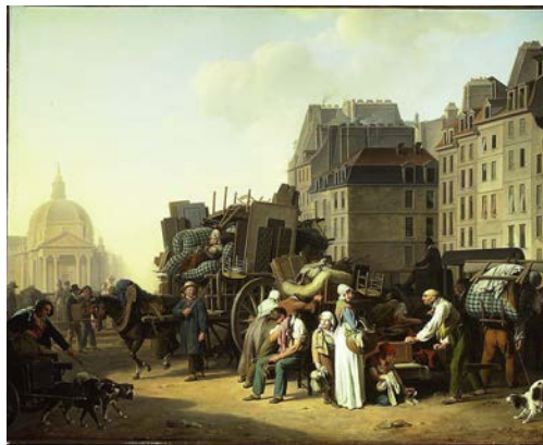
Painting of a family moving in the 19th century by Louis-Léopold Boilly - Public Domain