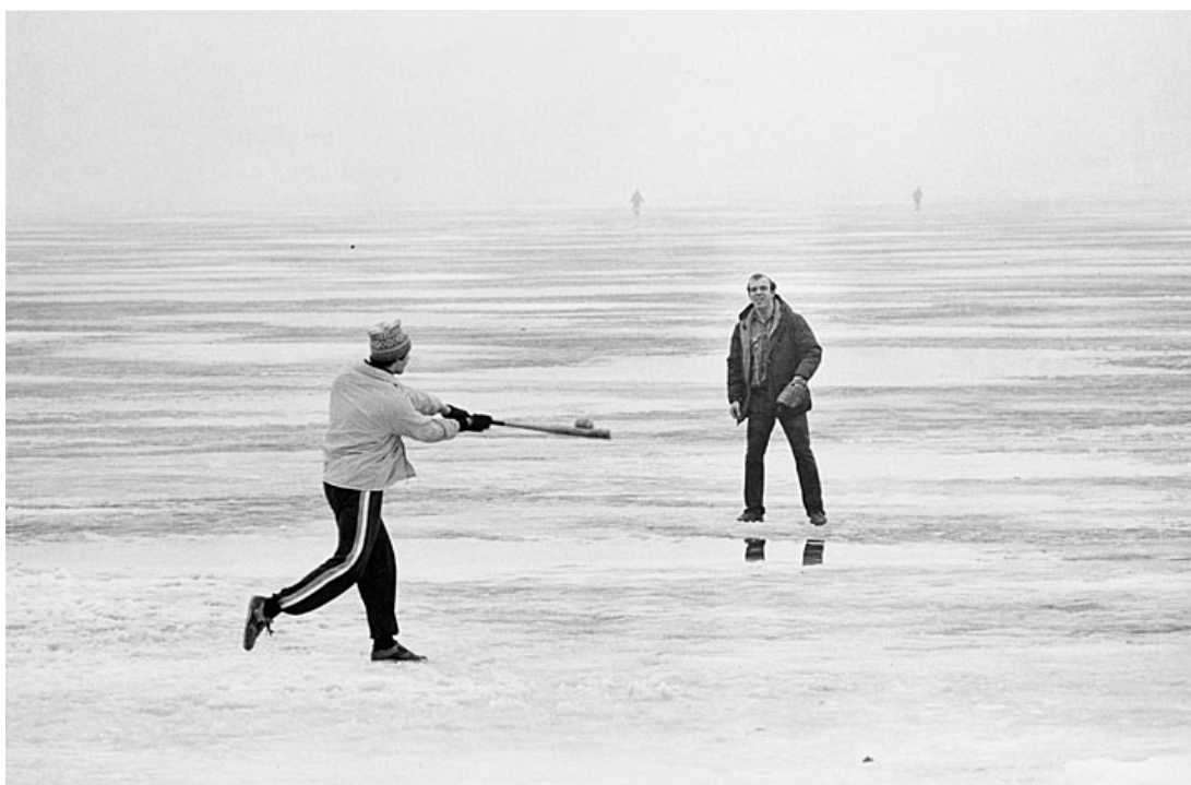
Baseball on Lake Mendota ice.

Preheader: NewPhotoIDResources,EquipmentTesting,ReferendumQuestions,Moversmailing,PollingPlaceAccessibility,Phishing,ClerkUpdates