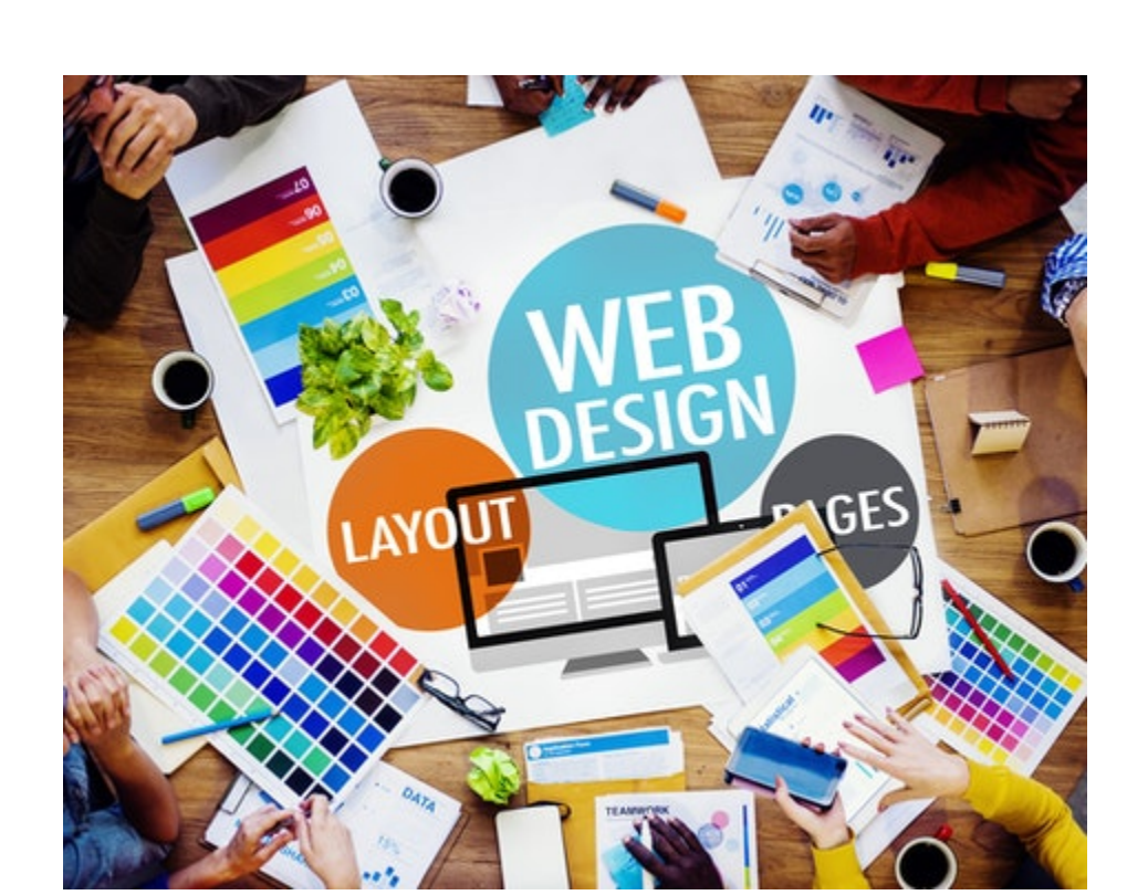
New WEC Website Goes Live In July

Starting the first week in July, the WEC's agency website will have a whole new look! With improvements on content organization and placement, along with an enhanced search function, we're confident the new website will better serve both clerks and voters alike.