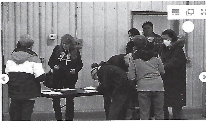
The line of Little Suamico town residents waiting to sign into a Jan. 30 electors meeting wrapped around the fire station and delayed the start of the session by more than 20 minutes.